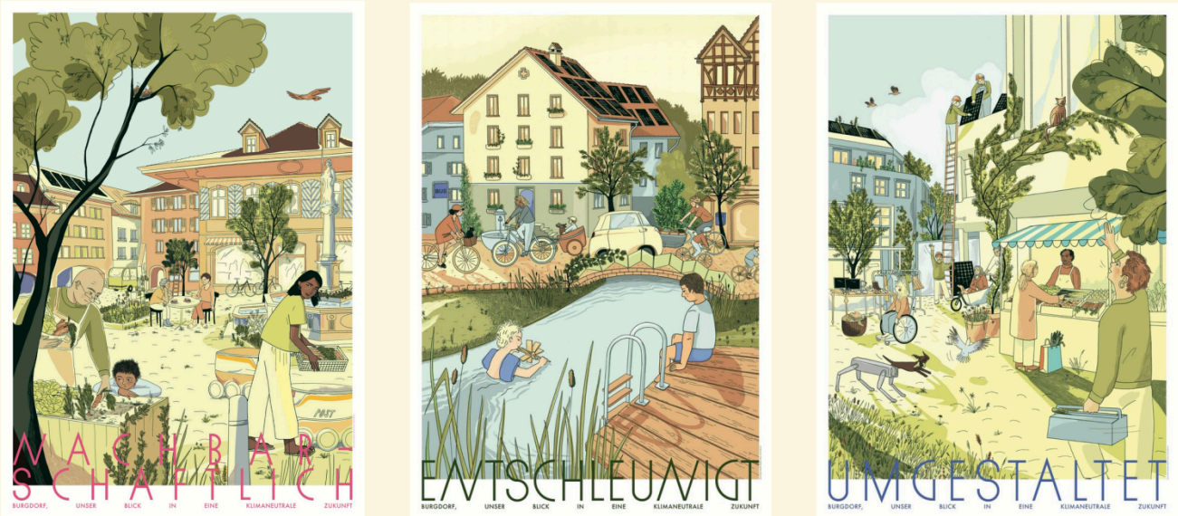
Image : Elena Kaeser, Simone Stolz (ZHdK - Fachbereich Knowledge Visualization)