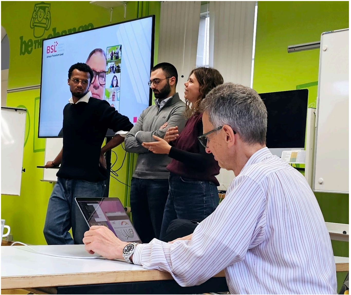
Figure 1: CE presentations by BSL MIB students.

The conference started with my brief introduction linking big issues of society with circularity, including an overview of the multitude of approaches to the Circular Economy, followed by presentations of mini-research projects by our students: